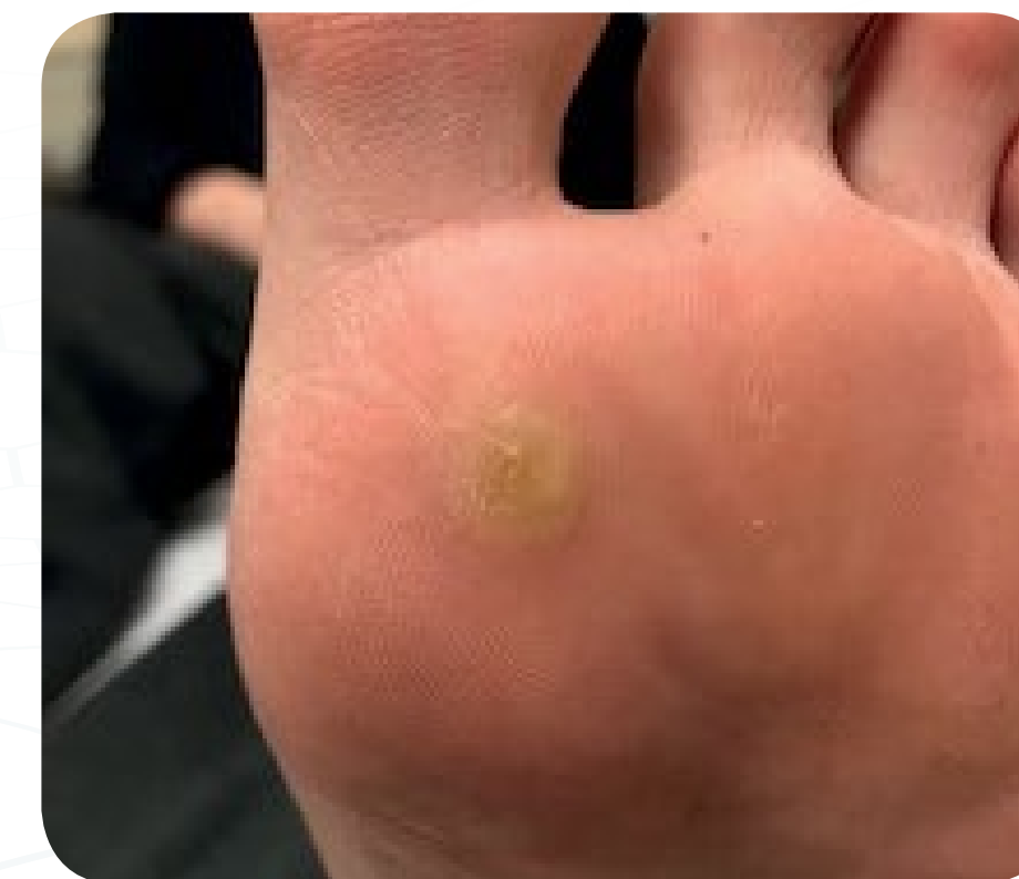
Plantar wart Treatment: 15-45 sec.