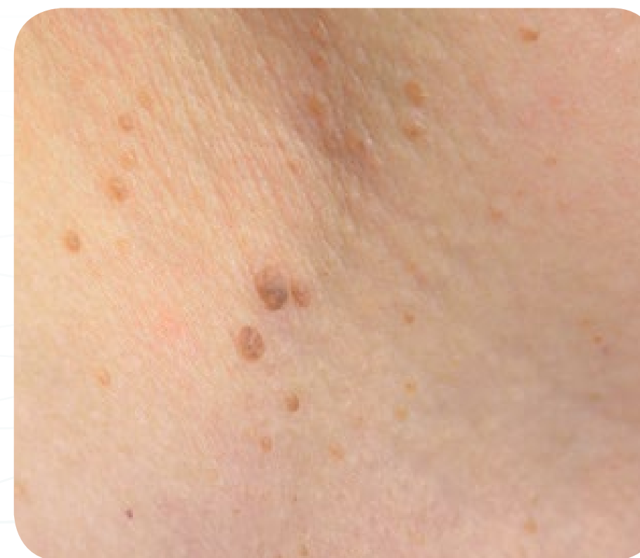
Common warts Treatment: 10-30 sec.