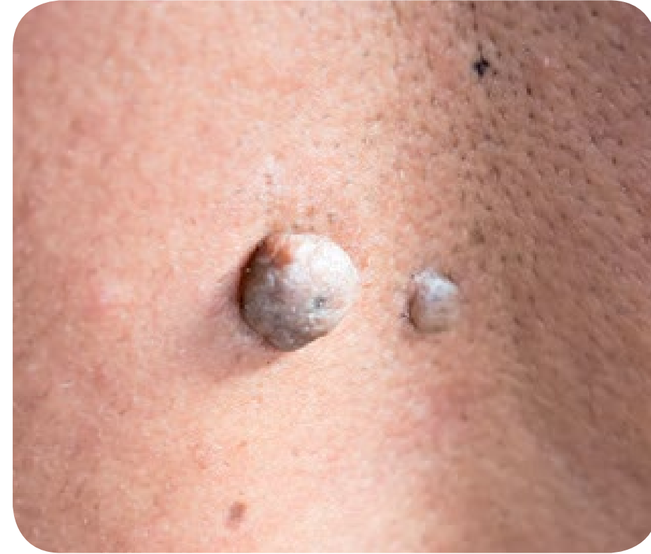
Acrochordon Treatment: 10-15 sec.