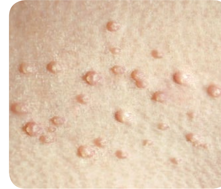
Molluscum contagiosum Treatment: 3-5 sec.