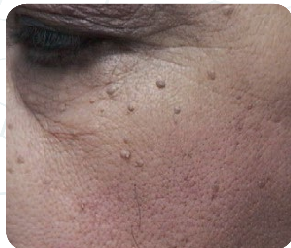
Skin Tag Treatment: 5-10 sec.