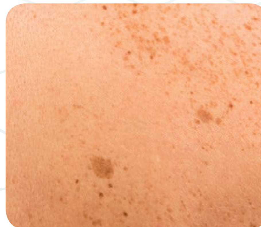
Pigmented Spot Treatment: 10-30 sec.