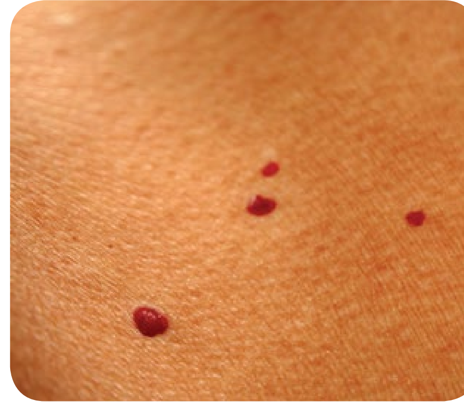
Hemangioma Treatment: 5-15 sec.