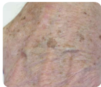
Solar lentigo Treatment: 15-45 sec.