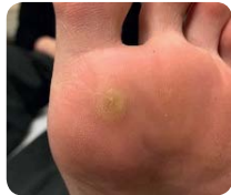
Plantar wart Treatment: 15-45 sec.