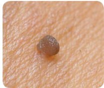
Seborrheic keratosis Treatment: 10-20 sec.