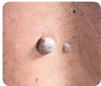
Acrochordon Treatment: 10-15 sec.