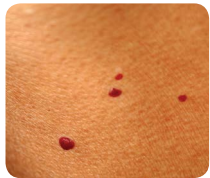
Hemangioma Treatment: 5-15 sec.