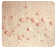
Molluscum contagiosum Treatment: 3-5 sec.