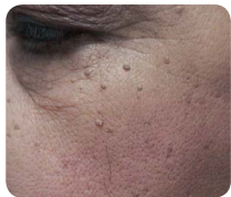
Skin Tag Treatment: 5-10 sec.