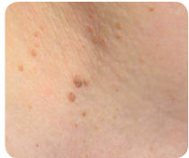
Common warts Treatment: 10-30 sec.