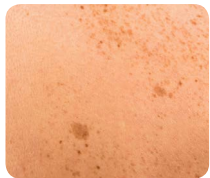
Pigmented Spot Treatment: 10-30 sec.